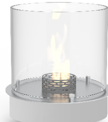
Nice Round Wall cut-out dimensions Ø305mm - dybde min. 100mm

Nice Built-in Burners™ is a built-in bioethanol burner that can be integrated in furniture, tables or countertops and can be used both indoors and outdoors.